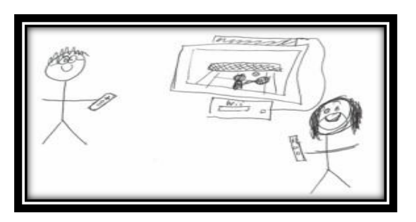
Figure 1: The example of drawing a picture that will be the main idea. (Peha, 2003:49)

Walton (2007: online), writing stories or narratives is much easier when the students have a picture.